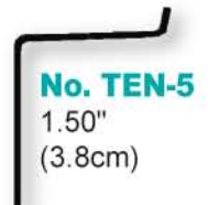
No. TEN-5 1.50" (3.8cm)