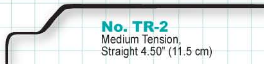
No. TR-2 Medium Tension, Straight 4.50" (11.5 cm)

These tension tools are designed for use on tulip-shaped door knobs.