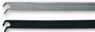
No. TEN-7 (Zinc Plated, Medium Tension)

These tension tools are for use on double-sided locks such as automotive door locks, furniture, cabinets and other cam locks.