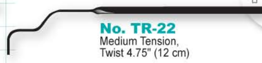
No. TR-22 Medium Tension, Twist 4.75" (12 cm)