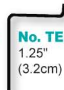
No. TEN-4 1.25" (3.2cm)