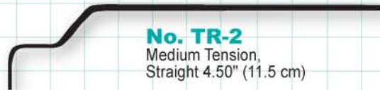
No. TR-2 Medium Tension, Straight 4.50" (11.5 cm)

These tension tools are designed for use on tulip-shaped door knobs.