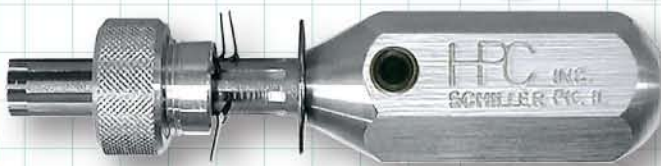
Model B No. TLP-CMOD-B