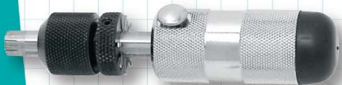
Quick Reset No. TLP-7SB

Standard Size I.D.- .312" (7.92mm) O.D.- .375" (9.53mm)