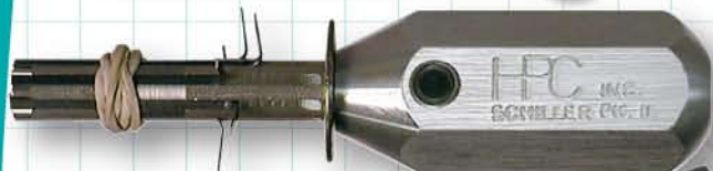
Standard 7-Pin No. TLP-C