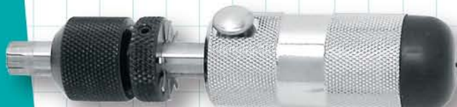
Quick Reset No. TLP-7SB

Standard Size I.D.- .312" (7.92mm) O.D.- .375" (9.53mm)