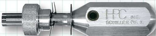
Model B No. TLP-CMOD-B