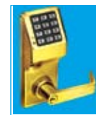
Lever set in US3 DL2700/3