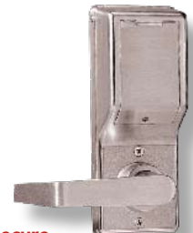
Secure battery compartment on inside door