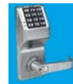
With IC Core in 26D DL2700iC/26D